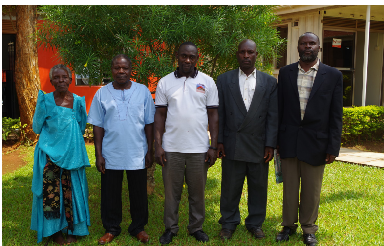
THE FIVE EVICTEES WHO HAVE SUED THE GOVERNMENT OF UGANDA AND KAWERI COFFEE PLANTATION LTD., REPRESENTING 401 FAMILIES. (JULY 2019)

In 2016, one woman said: "The majority of our girls have gotten married at the ages of fourteen, fifteen or sixteen; the average is sixteen years because they were idle and didn't attend school."