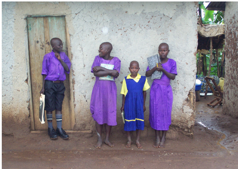
MANY PUPILS DO NOT EVEN HAVE SHOES. (MARCH 2006)

One interviewee highlighted the gravity of the negative impacts caused by the eviction in the following testimony: "There is a problem of poor education since the