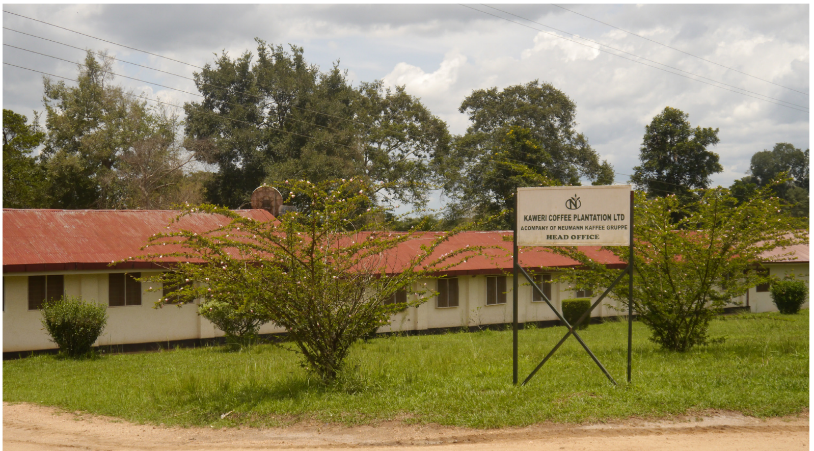
THE FORMER KITEMBA PRIMARY SCHOOL HAS BEEN TRANSFORMED INTO THE HEADQUARTER OF KAWERI COFFEE PLANTATION (MARCH 2013)

Consequently, in 2017, in its concluding observations, the CEDAW committee has recommended that Germany: