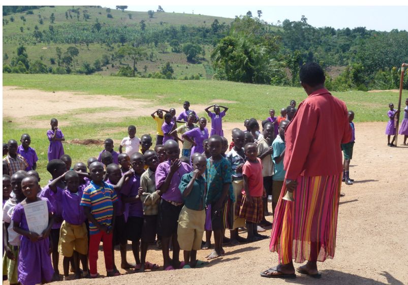
MANY PUPILS OF NEW KITEMBA PRIMARY SCHOOL CANNOT AFFORD SCHOOL UNIFORMS. (AUGUST 2017)

According to General Comment 14 68 of the CESCR, the right to health includes the right to a system of health protection which provides equality of opportunity for people to enjoy the highest attainable level of health. In this regard, the State of Uganda has breached the right to health of its citizens. The African Charter on Human and Peoples' Rights (Art. 16) 69 requires States to take necessary measures to protect the health of their people and to ensure that they receive medical attention when they are sick. In this regard, the state of Uganda failed as well.