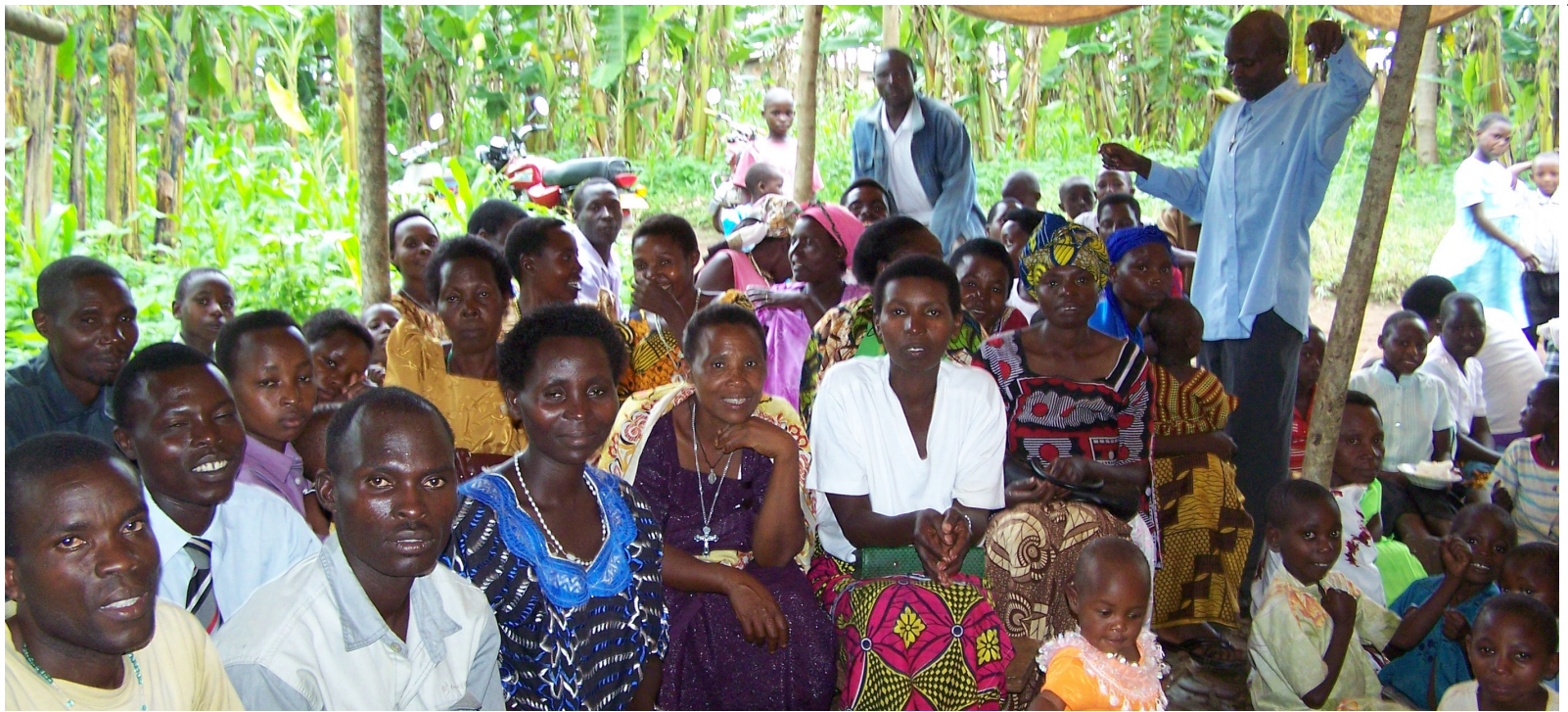
FOR MANY EVICTEES, CELEBRATING CHURCH SERVICES IS IMPORTANT. (OCTOBER 2010)

and...: b) Take effective measures aimed at preventing, investigating, prosecuting and punishing acts of violence against rural women and girls, ..., whether perpetrated by the State, non-State actors or private persons; c) Ensure that victims living in rural areas have effective access to justice, ... and that authorities at all levels in rural areas,..., have the resources needed and a political will to respond to violence against rural women and girls,...” 84