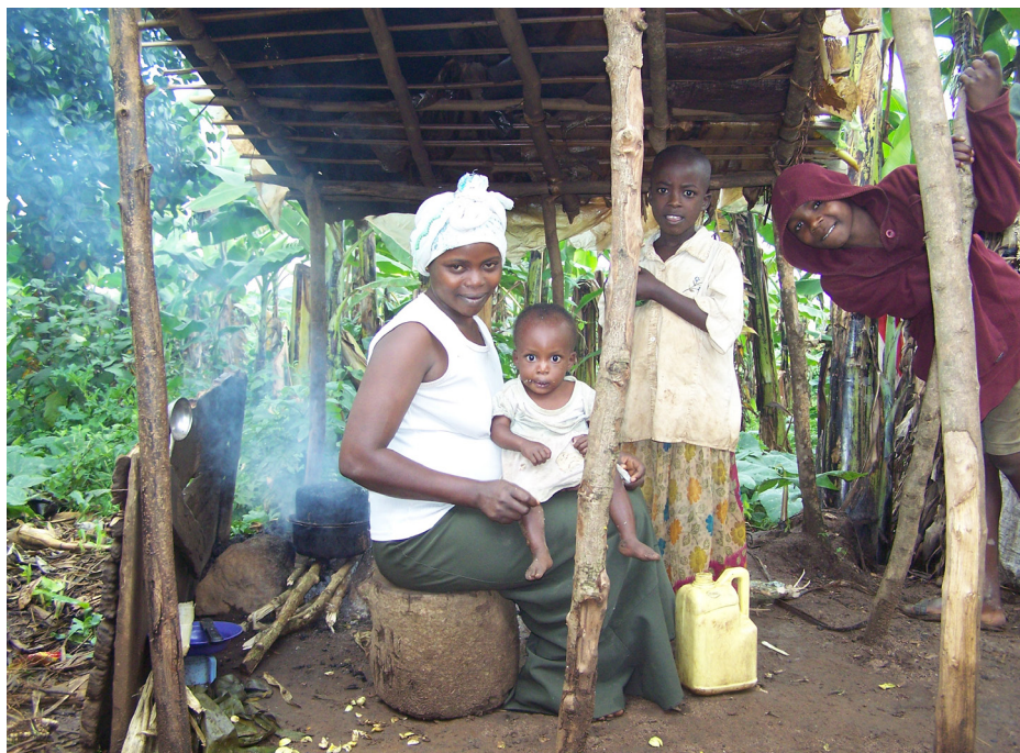
THE WOMAN LOST TWO SIBLINGS DUE TO THE EVICTION.

did this because they couldn’t sustain themselves either, so they were forced to leave their children and went to look for some work to do in other places. Children go a long time without eating food. For example, we have children who go almost a day without eating. The experience of hunger is the same for boys and girls. So, due to starvation, children move around the community looking for things to eat and this has led many to join peers that have greatly affected them. They have learned how to use marijuana, and most of the youth now in Kyengeza are drug addicts.”