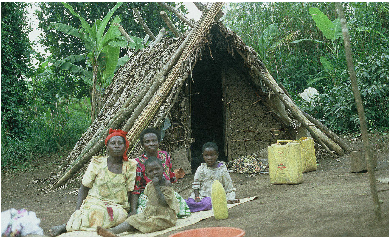
IN AUGUST 2003, TWO YEARS AFTER THE EVICTION, FAMILIES STILL LIVED IN MAKESHIFT SHELTERS.