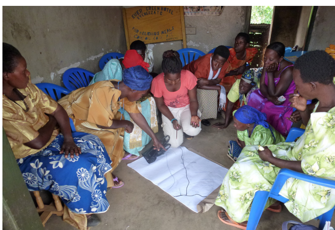
WOMEN SHOW ON A MAP WHERE THEIR COMPOUNDS HAD BEEN LOCATED BEFORE THE EVICTION. (OCTOBER 2014)

On 30 January 2017 statements of the interviewees which referred to Kaweri Coffee Plantation Ltd. were sent to the headquarters of the Neumann Kaffee Gruppe (NKG) in Hamburg for comment. NKG answered on 22 February 2017 and denied all statements and accusations against them. To verify the information provided by the evictees, two researchers investigated some of the issues in question again, interviewing 27 women and a police officer in Kyengeza on 2 August 2017. On 24 to 25 August 2017 another researcher assisted by an interpreter and accompanied by a journalist interviewed the headmistress of the