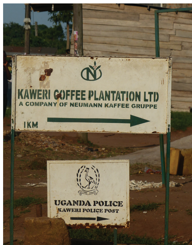
KAWERI COFFEE PLANTATION IS SUPPORTED BY THE UGANDAN STATE

5. Since 2004, through letters or during personal meetings, the evictees have asked the German government several times for support, but the government has not responded. 17