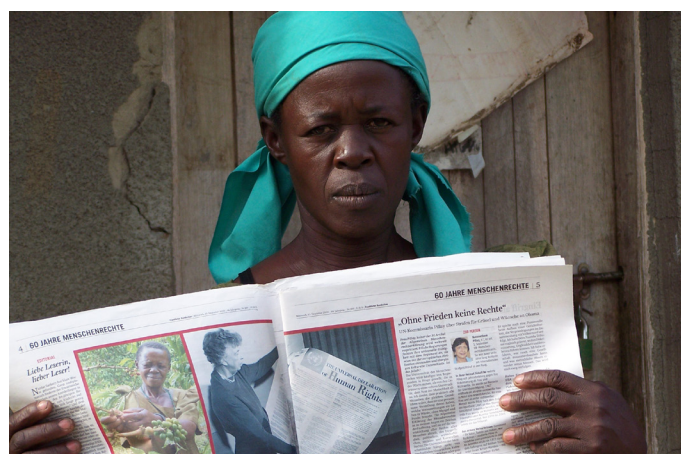
EVICTED WOMAN HOLDS GERMAN NEWSPAPER WHICH HAD REPORTED HER STORY.

New Kitemba Primary School and checked five of the seven boreholes and two of the three water pipes with several taps around the plantation. Furthermore, five men and four women were interviewed. From 28 June to 5 July 2019, the same researcher assisted by an interpreter went again to Kyengeza and interviewed the (at that time) new headmaster of the New Kitemba Primary School as well as two of the evicted families, the LC I and the spokesperson for the evictees.