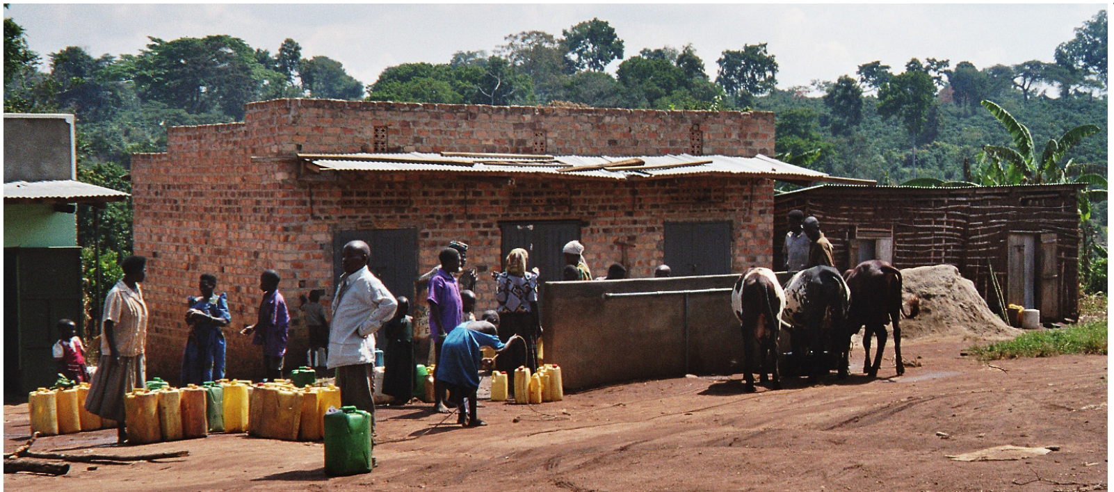
THE WATER PIPE IN KYENGEZA DID RARELY OPERATE. (AUGUST 2008)

lenged. They grew crops and were able to feed themselves in a sustainable way. Moreover, being bona fide occupants of the land should enable perpetual future occupancy of the land (Article 3(2) Land Act 41 ). Any conflict that involves a bona fide tenant, unless solved amicably, should be brought before a court of law.