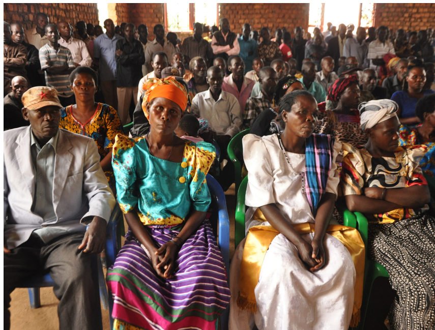
ASSEMBLY OF THE EVICTEES TO DISCUSS NEXT STEPS OF THEIR STRUGGLE FOR REDRESS (APRIL 2017)

Following the eviction, there have been an increasing number of illnesses and deaths amongst the evictees. A pregnant woman lost her unborn child due to the distress, while a man died following injuries he obtained during the eviction, for example 60 . The eviction has led to starvation, malnourishment of children and undernourishment of adults. According to the affected communities in contact with FIAN, five children have died after the eviction because of malnourishment and diseases (malaria and diarrhoea for instance). Furthermore, people report an increase in teenage pregnancies since the eviction, which