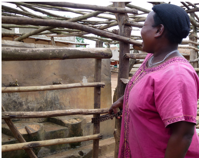
THE FENCE OF THE WATER TAPS IN KYENGEZA IS LOCKED. (MARCH 2014)

According to Article 14 paragraph 1 of the UN Covenant