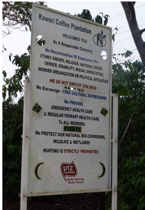
SIGNPOST AT THE ENTRANCE OF KAWERI COFFEE PLANTATION (AUGUST 2016)

fee Gruppe (NKG) based in Hamburg, Germany. According to FIAN's analysis the eviction was illegal. The eviction and its consequences have been thoroughly documented since 2002 4 by FIAN and others. 5 The event was described by the evictees as particularly cruel. During FIAN's visit in August 2016, various women testified about what happened: "When we were evicted from the land we ran with my husband and life was too hard for both of us and my husband died leaving me with five children. After his burial, my elder daughter also followed due to severe sickness that resulted from the miserable conditions we lived in. During that time, I lost three children and those that had remained also ran away from the village and left me with grandchildren...".