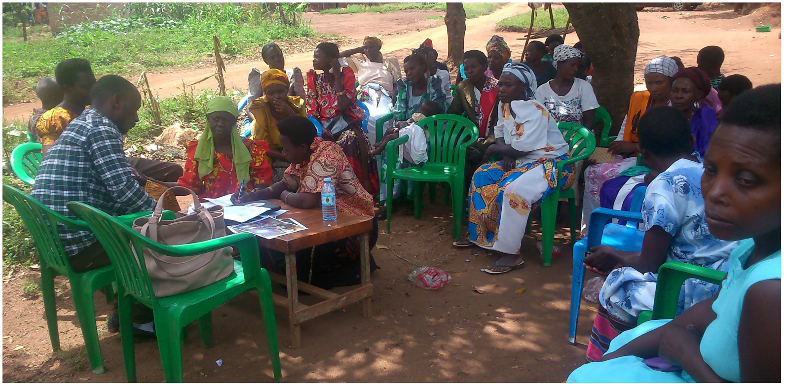
WOMEN REGISTER BEFORE A FOCUS GROUP DISCUSSION. (AUGUST 2017)

to work on the plantation only during school holidays 79 , during which time they would pick coffee. She said that almost 80% of the pupils of P3 to P7 who are 12/13 years old would work on the plantation during school holidays.