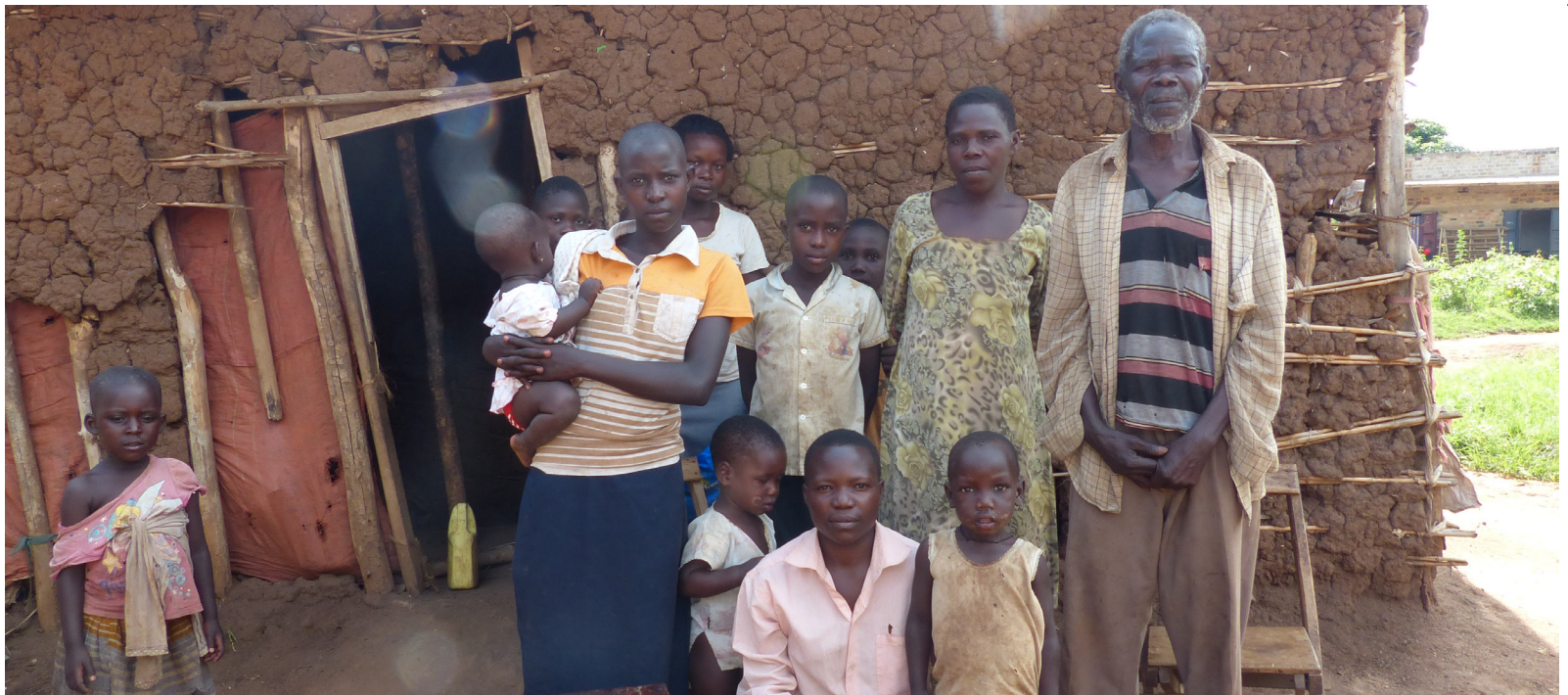
SINCE THE EVICTION, MANY FAMILIES LIVE IN HOUSES OF POOR QUALITY. (NOVEMBER 2013)

tricht principles: 24) to ensure that the right to water of the evictees is not abused by the actions/omissions of NKG. The Maastricht principle 24 should be interpreted together with principle 25 (c) and these go hand in hand with principle 32 (a) which states: “In fulfilling economic, social and cultural rights extraterritorially, States must: a) prioritize the realization of the rights of disadvantaged, marginalized and vulnerable groups”.