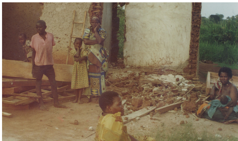
FAMILY IN FRONT OF THEIR DESTROYED HOUSE IN AUGUST 2001

The inhabitants were threatened and forced to leave at gunpoint and several of those being evicted were beaten in the process. The soldiers set houses on fire and demolished them, including the fully equipped private clinic