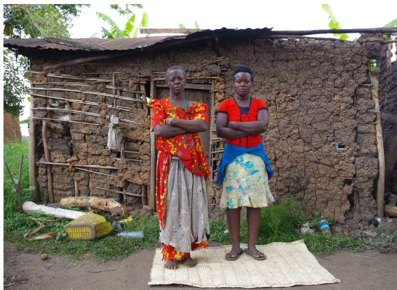
THE FAMILY DOES NOT HAVE MEANS TO REPAIR THE BROKEN HOUSE (JULY 2019)

He had to work from 7 am to 1 pm but he did not have a working contract. While his tools were provided by the plantation, he did not get protection gear. He was not aware of a complaint procedure at the plantation and addressed complaints only to his supervisor. He complained about the low salary paid by the plantation, which was not enough to sustain his family. He needed to spend 6,000 UGX per day for food and 15,000 UGX per month for renting a one-room house. When asked what he would request for a salary, he answered 8,000 – 10,000 UGX per day (equivalent to 2,00 - 2,50 €).