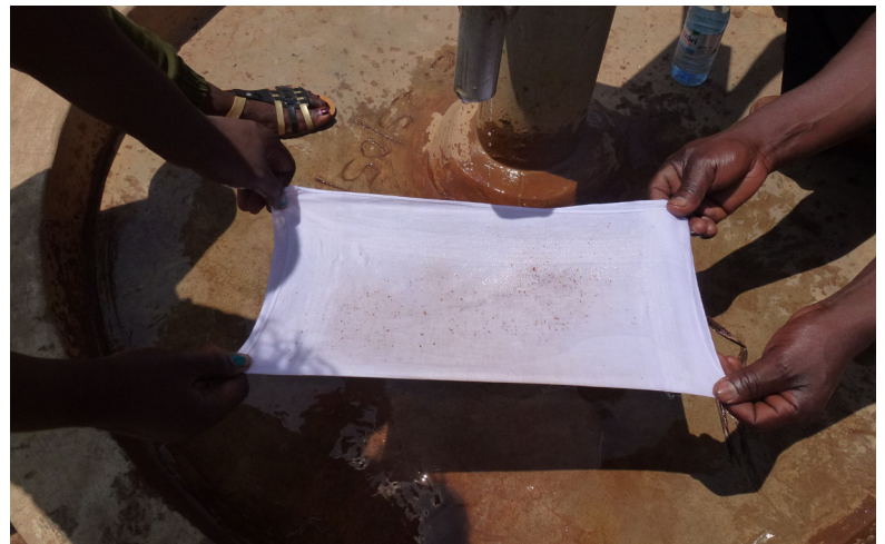
WATER WITH DARK PARTICLES COMING OUT OF THE BOREHOLE IN LUWUNGA. (AUGUST 2017)

In 2004, after FIAN's intervention, Kaweri/NKG built a pipeline going from the plantation to Kyengeza. However, for many years the water only ran sporadically and was not supplying enough water for the evictees. In 2019, the pipeline was closed completely. Women now have to walk long distances to collect potable water. 50 Elderly women reported that they cannot carry water for this long a distance. They either have to pay someone to carry water for them or they have to use unsafe water sources 51 .