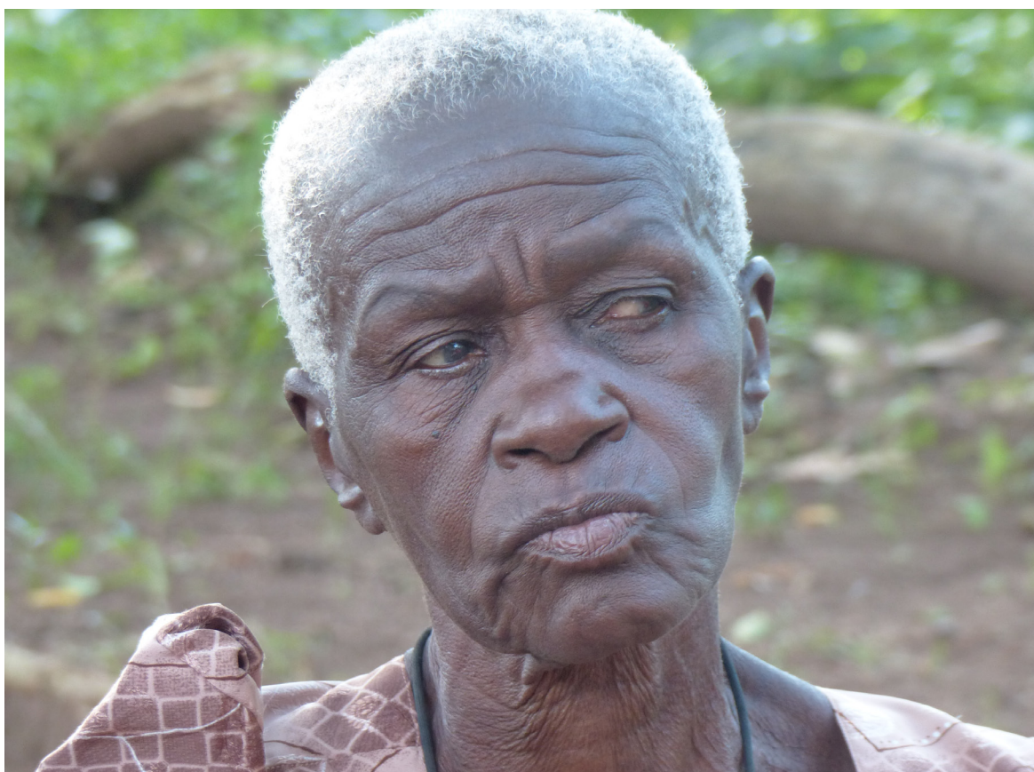
ELDERLY EVICTED WOMAN DEMANDING COMPENSATION. (NOVEMBER 2013)

FIAN will continue to support the evictees in their human rights-related demands as they struggle against Uganda and Germany for the breaches of human rights obligations these states have committed, and against Kaweri/NKG Coffee Plantation for their human rights abuses.