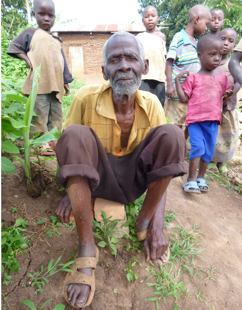
A STARVING OLD MAN, TOO WEAK TO WALK. (OCTOBER 2014)

“16 (a) Strengthen its legislation governing the conduct of corporations registered or domiciled in the State party in relation to their activities abroad, including by requiring those corporations to conduct human rights and gender impact assessments before making investment decisions;