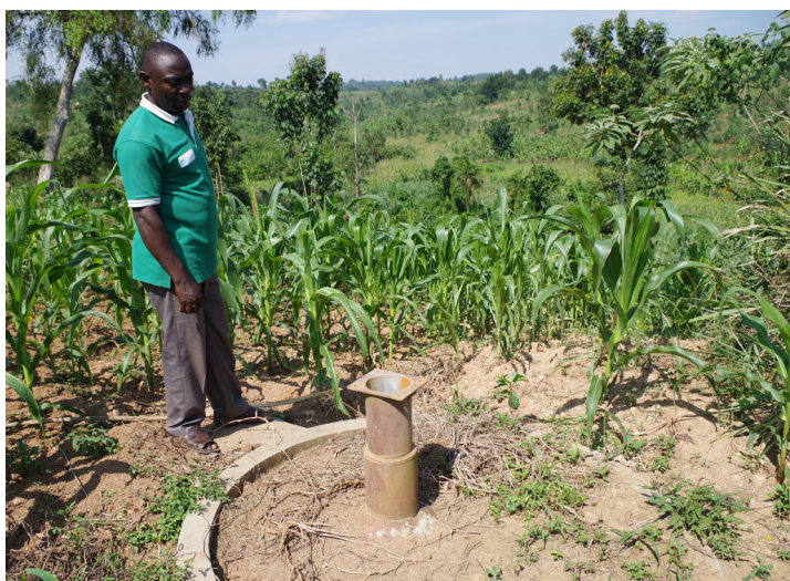
ABANDONNED BOREHOLE. (JULY 2019)

months. According to the community, they have informed Kaweri Coffee Plantation about it, but the company has not worked on the issue. The headmistress of New Kitemba Primary School reported that the first borehole at the school had been closed in 2003 but that the one drilled by ActionAid was still operating. The water pipe in Luwunga rarely provided water. Its fence had not even been locked. One woman reported: “Water can come one day and then it remains dry for one week. We don’t know when water will flow.” The evictees complained that Kaweri Coffee Plantation did not react to their report about the unsatisfying performance of the tap. Fittingly, in 2017, the statistics of the four Health Centres/Hospitals contacted listed many cases of diarrhoea and other water borne dis-