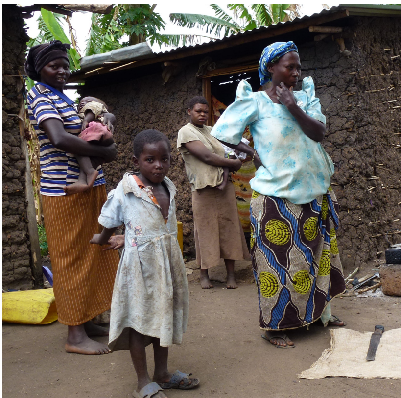
WOMAN AND CHILDREN ARE ESPECIALLY AFFECTED BY THE IMPACT OF THE EVICTION (FEBRUARY 2014)

tion 39 (Article 26, 29 (2-a) and 237 (1, 3-a, 8) which highlights that no person shall be compulsorily deprived of property unless it is necessary for public use or in the interest of defence, public safety, public order, public morality or public health and which requires that, prior to the repossession or acquisition of property, prompt payment of fair and adequate compensation has to be made. In addition, many of the evictees were lawful customary tenants who are guaranteed security of oc-