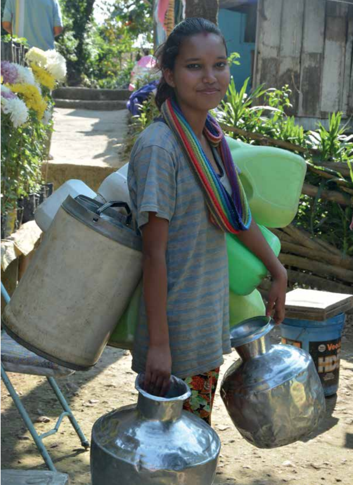
Workers, especially female family members, travel long distances to fetch water.