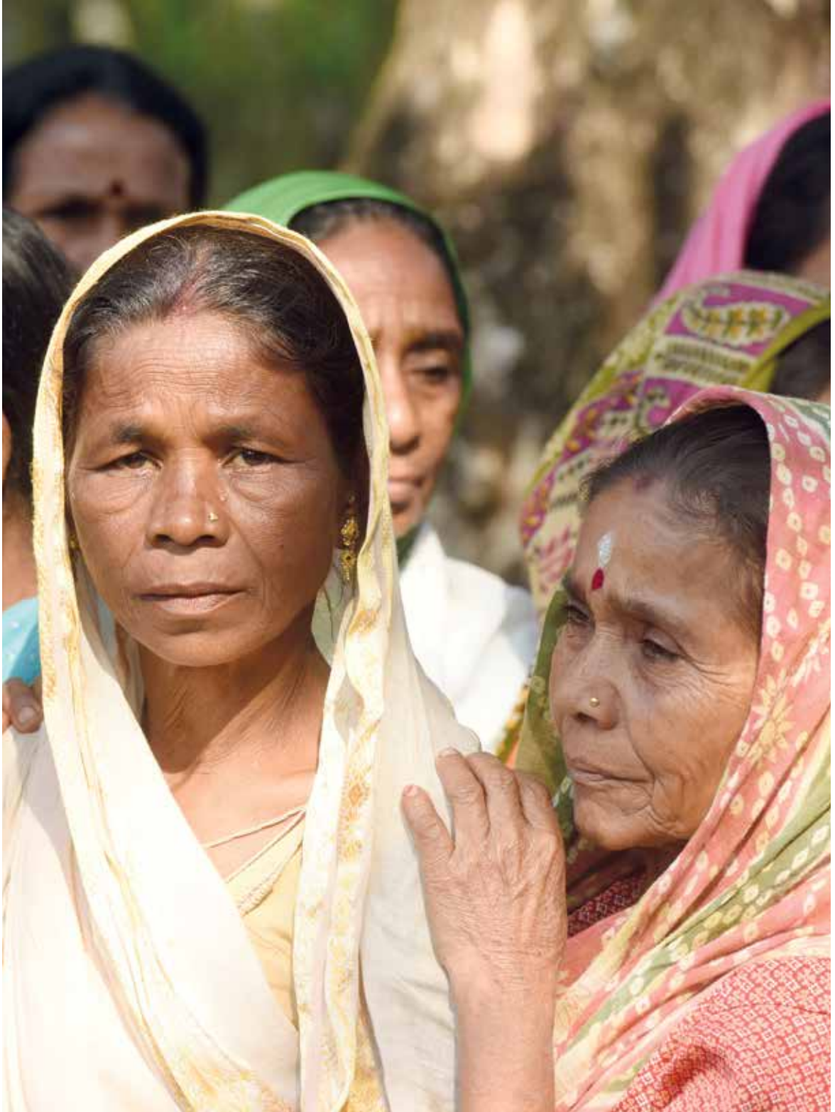
India is in violation of its human rights obligations to respect, protect, and fulfil women's rights, in particular those related to equal work in the context of tasks assigned, promotion opportunities, wages, status, and access to benefits.