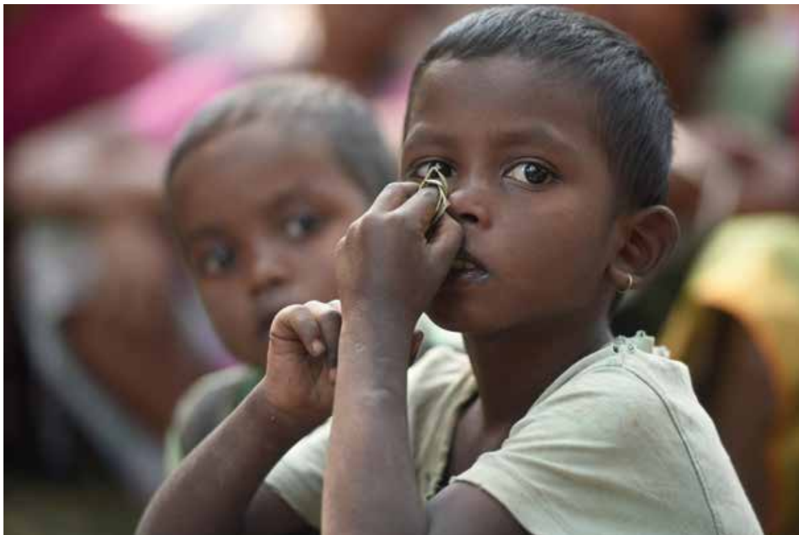
Nutritional well-being is not merely an ultimate goal, it is also a prerequisite for human beings to be healthy and to work.

international legal framework in place for the RTFN), both documents lamentably fail to incorporate all the dimensions of the RTFN in an exhaustive manner. The current dominant interpretations of this human right overlook women's rights and gender, as well as the intrinsic links between food and the social process around food and nutrition (i.e. governance of, access to and control over resources –land, water, seeds, etc.; participation in the governance of food production, how food is produced, by whom and for whom; food processing; food supply and distribution; food marketing; food preparation; food consumption; and the ultimate promotion of nutritional well-being and related capabilities). Indeed, the RTFN is more than the right to foodstuff. It is also more than the mere access to food that may be nutritionally and culturally adequate and safe. The RTFN can only be realized when there is a social process in which people, women and men equally, have choices at hand and can decide on how to engage with Mother