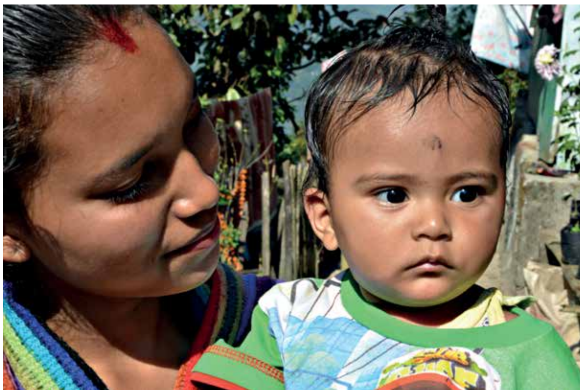
Violations related to the protection of the health of the mother during pregnancy, maternity leave benefits, breastfeeding breaks, and prenatal and postnatal care were widely reported.

right up to their eighth month of pregnancy, which is when most women begin taking maternity leave. Pregnant women are expected to pluck the exact same amount of leaves as the others, as no break is given to them; their wages are deducted if the task work is not met. Women also reported having to go back to work two months after the delivery, and not being provided with any sort of relief upon return, in violation of the CEDAW’s Article 12(2) (requiring State Parties to “ensure to women appropriate services in connection with pregnancy, confinement and the post-natal period”) and the CRC’s Article 24(d) (“to ensure appropriate pre-natal and post-natal health care for mothers”). The team encountered several women who had explicitly asked management for relief (for example, fewer working hours and lighter tasks) during the pregnancy and lactation periods, but had been in fact scolded by management for these requests. Furthermore, it was found that leaves are often plucked only 12 days