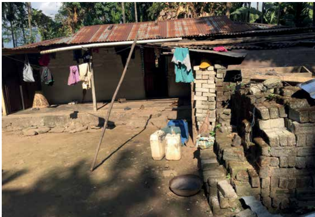
Family house showing the unsanitary and crowded conditions that often lead to the easy spread of tuberculosis.

She was advised by the FFM team to identify a doctor and go to his/her service to get a second opinion on her cough history, and to be able to protect her son as well, in case she has tuberculosis.