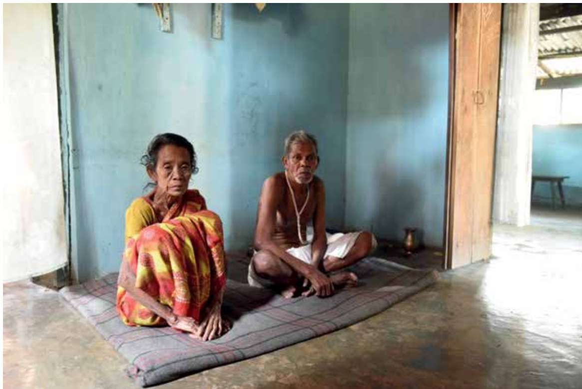
Tea plantation workers struggle to secure their access to food and nutrition.

they were not allowed to vote in local elections for their “Panchayats” (village self-governments). Even today, any development work that the “Panchayats” want to take up in the area of an estate has to first get a No Objection Certificate (NOC) 35 from the management. Moreover, workers are often denied access to many government schemes. For example, a rural housing scheme, Indira Awas Yojana, is never extended to them because their houses are on “company land”; water points, roads and even schools are never developed because they are the “company’s responsibility”. With the “company” not fulfilling its side of the bargain and the government turning a blind eye, workers always end up being overlooked and deprived of their basic rights.