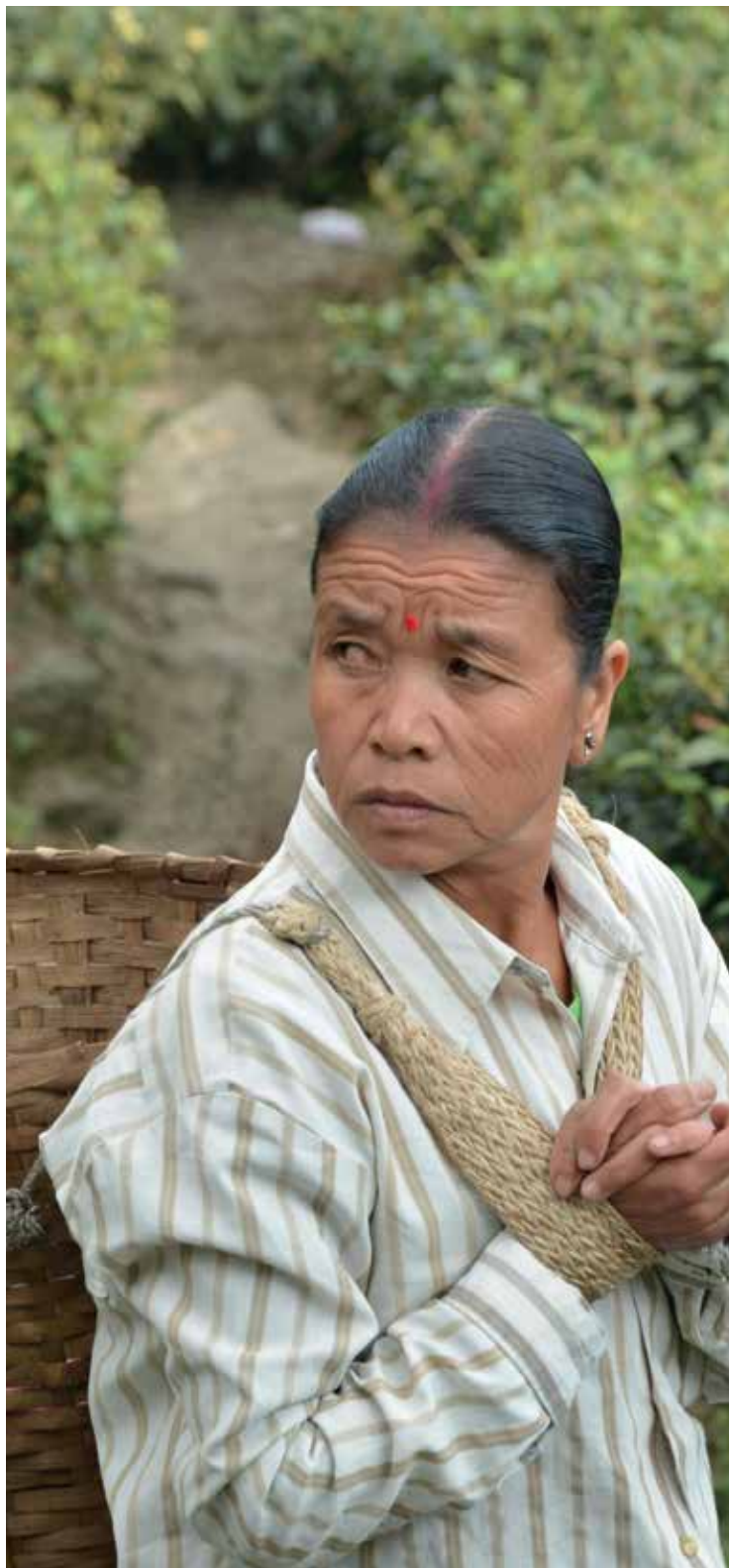
Employment of women in plantations historically was sought in order to "contain the male labour force" and to "ensure steady reproduction of 'cheap' labour".

Women's labour has remained central to tea production since the creation of the tea plantation workforce in India. Employment of women in plantations historically was sought in order to "contain the male labour force" and to "ensure steady reproduction of 'cheap' labour". 30 Women were also perceived as more able to engage in "quality" picking of tea leaves, which, combined with the need to "populate" the tea plantation workforce, resulted in a higher number of women being recruited as tea plantation labourers than men. 31 This disproportionately higher number of women in the tea plantations in India—and the accompanying subjugation of this workforce—is a phenomenon that continues today. The tea industry is one of the few industries today that is family-based and depends mainly upon women to work the tea beds. Unlike men, who dominate positions that are often better paid (such as factory workers and supervisors),