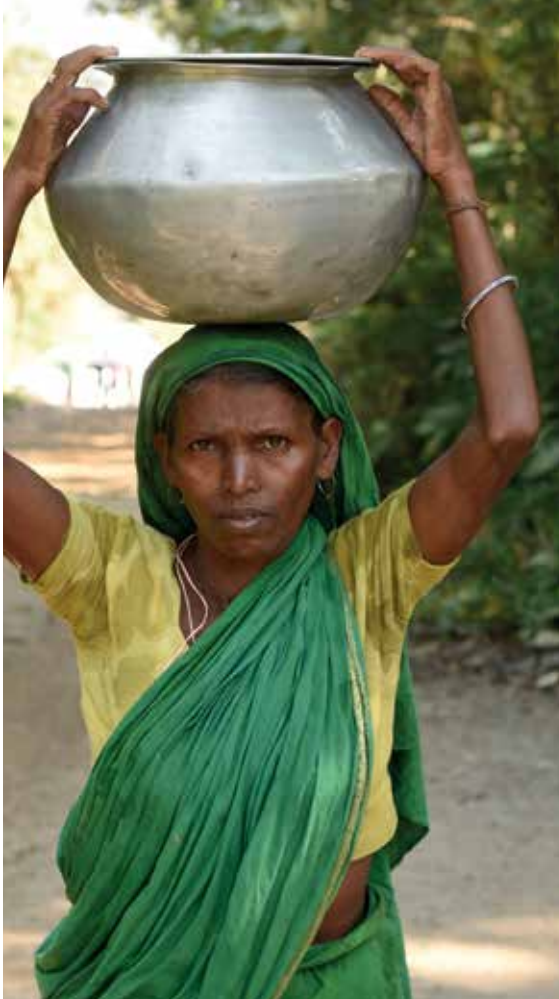
The Indian Constitution, one of the most progressive in the world for its time, recognises the centrality of human rights, and it guarantees equal rights to all citizens, without discrimination.