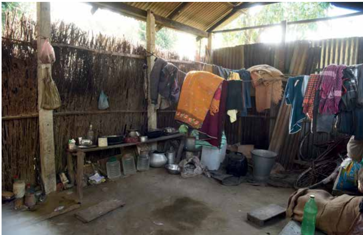
The tenure right of the tea workers is entirely attached to the labour they provide; with workers having no legal tenure right, any management staff has the power to evict any worker currently out of work.

hazardous employment, and Article 45 guarantees free and compulsory education for all children until age 14. The PLA also rules out employment of children below age 14. Although the FFM team did not observe child labour at the plantations, some interviewed workers revealed that children were sometimes brought to the field to help their female parents who otherwise would not be able to complete their task work. Furthermore, by allowing children to work at plantations, whether formally or informally, India violates Article 32 of CRC, which “recognize[s] the right of the child to be protected from economic exploitation and from performing any work that is likely to be hazardous or to interfere with the child’s education, or to be harmful to the child’s health or physical, mental, spiritual, moral or social development.”