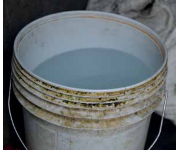
Workers reported that the quantity and quality of water to which workers have access is a severe problem.

Many female workers revealed that they suffered from anemia and reported that malnutrition among children is common, as families cannot provide food for the children all the time. Anemia, jaundice and fatigue are common physical symptoms. Several women said that only retired doctors worked at plantation hospitals; they complained that in one particular plantation currently there is a very old and senile doctor, who unfortunately has not been replaced by a younger, preferably female doctor.