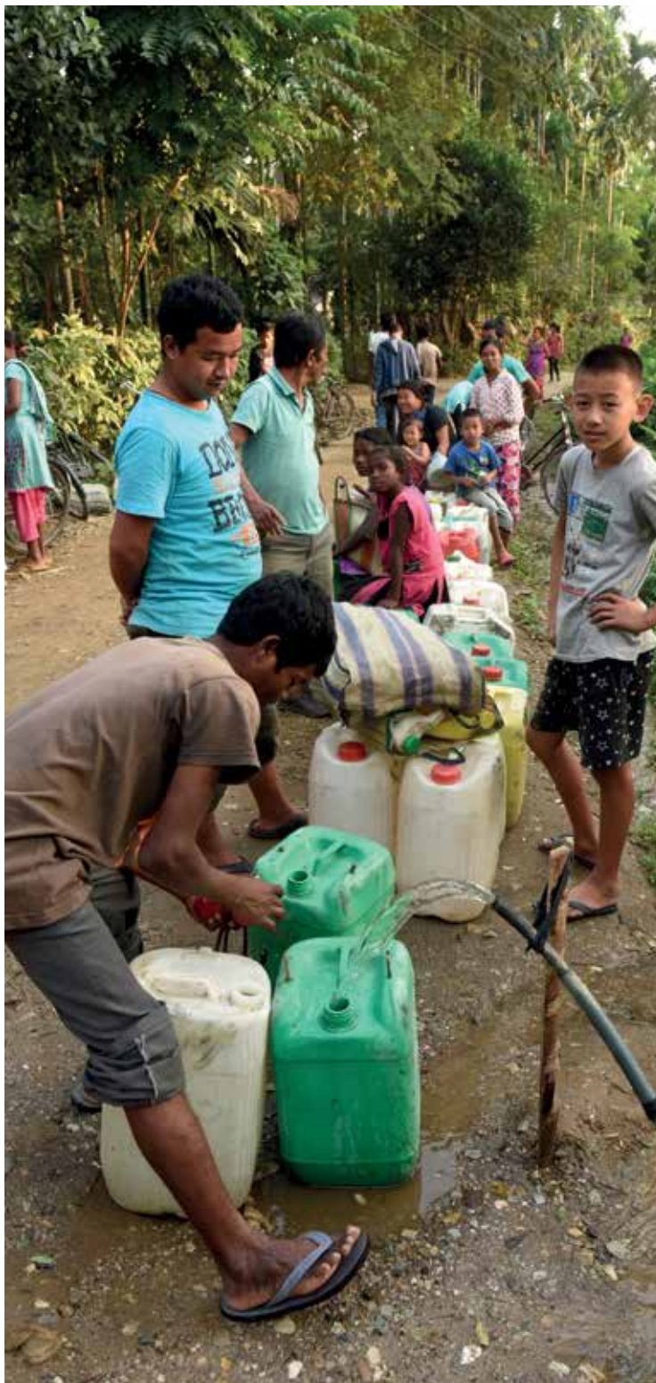
State authorities have failed in their obligation to ensure access to drinking water and to protect the sources of water for human consumption against contamination by pesticides.