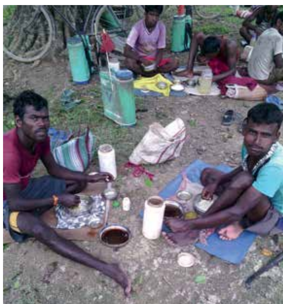
Pesticide sprayers often eat lunch without having washed themselves after exposure to dangerous chemicals.

According to workers, their ability to accomplish the required tasks is limited in the face of the heavier workload that is expected of them as a result of a recent increase in their wages. Before the wage increase, the task entailed picking 21 kg of tea leaves; however, under the new wage, they are required to pick 24 kg in the same amount of time. If the amount picked is less, their wage is deducted by 1 INR for each kg picked. One female worker told the FFM team that she has to prune 500 tea bushes in one day to fulfil her task and she sometimes has to take a helper with her, usually her spouse or son who is 15 years old, in order to accomplish it. During peak season, workers have to cover a very large area of the tea garden—workers complained that irrespective of whether there might be fewer workers or some workers might be absent, workers who are present have to still cover all of the tasks required of a larger workforce and they often do so without a break except for the 45 minutes of lunch. Women also complained that they are often given the tasks of clearing bushes, which is very time consuming. Furthermore, during the lean season, wages are typically deducted by one kg (1 INR) because workers simply cannot fulfil the task of picking a certain amount of leaves.