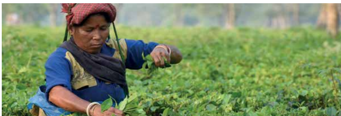
Article 21 of the Indian Constitution has been interpreted to include the right to food and nutrition as well as the right to water.

Besides utilizing the Constitutional guarantee of rights, India has over the years legislated a large number of rights by amending the Indian Constitution where appropriate, and it has referred to Parliamentary legislation. Some legislation has been periodically re-enacted, with stronger provisions introduced from time to time. Many of these laws—if duly enforced—contribute to the realization of the right to food and nutrition of tea workers (See Annex 3 for the list and description of relevant laws and acts in India).