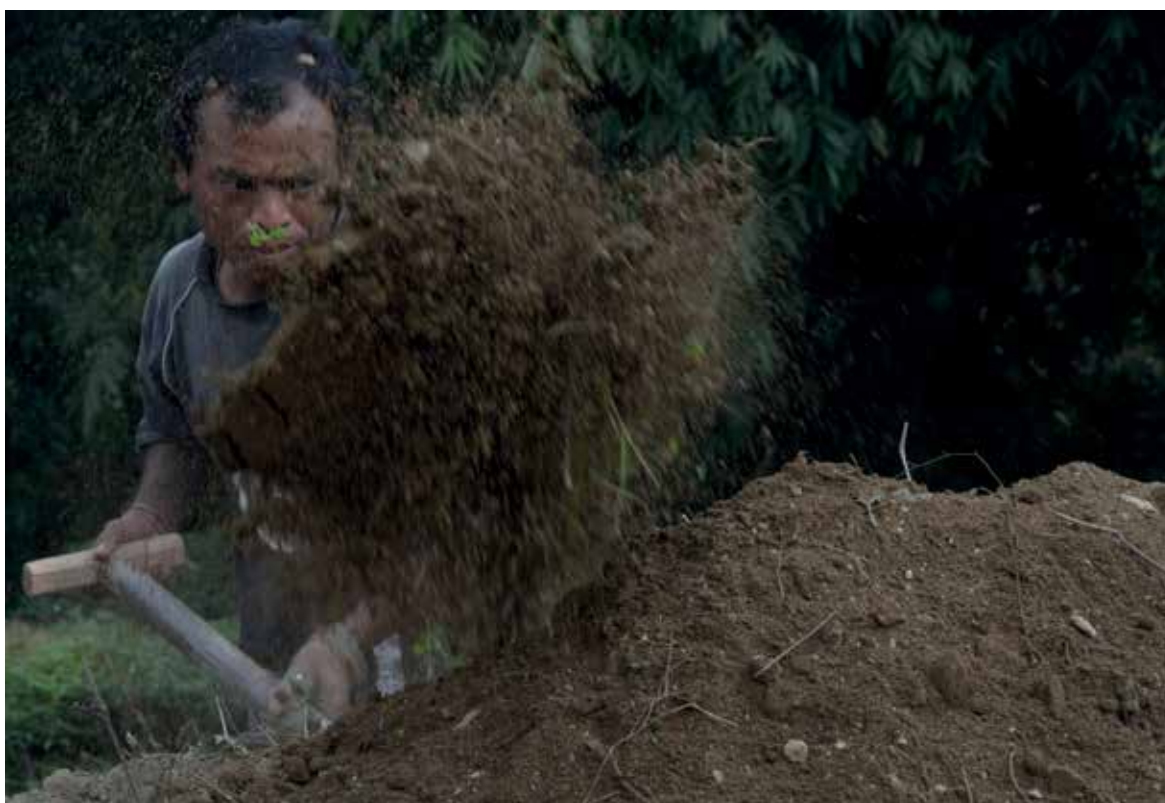
Tea plantations were established on the basis of empty promises such as easy tasks, ideal work conditions, good pay and unlimited land available, which motivated workers throughout various states to migrate.

and unlimited land available for cultivation were made, which motivated workers throughout various states to migrate. Private contractors or “Arkattis” were usually deployed to hire labourers for tea estates. 27 The long journey—sometimes covering a distance of 800 km—often caused sickness and high mortality rates. 28 After the migrant labourers reached the tea estates, their mobility was limited to the vicinity of the tea garden and factory. They were completely isolated from the outside world and had barely any contact with the local inhabitants. The labourers were deliberately made dependent on the basic facilities provided by the tea estate, and