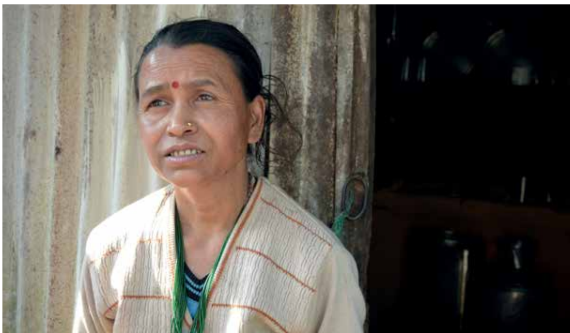
Violations of women's rights and discrimination on the basis of gender in violation of international and Indian law, were found in virtually all tea gardens that were visited.