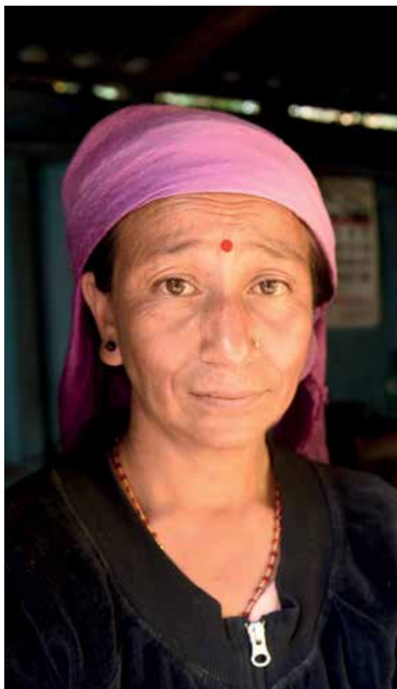
Guaranteeing women's rights, on the one hand, and understanding the core linkages between women's rights and children's rights, on the other, are fundamental to the eradication of hunger and malnutrition.

adult malnutrition and mortality, in particular in South Asia, is the result of the structural violence against women still prevalent in societies. The combination of low social status and social exclusion of girls and women, limited access to food, public policies and services, and child marriage, results in malnourished mothers, low birth weight and infant malnutrition (stunting), increased risk of childhood death, and a significant increase in risk of developing overweight and obesity in adolescence and adulthood, which are then associated with suffering and early death due to chronic non-communicable diseases (cardiovascular diseases, cancer, diabetes, etc.).