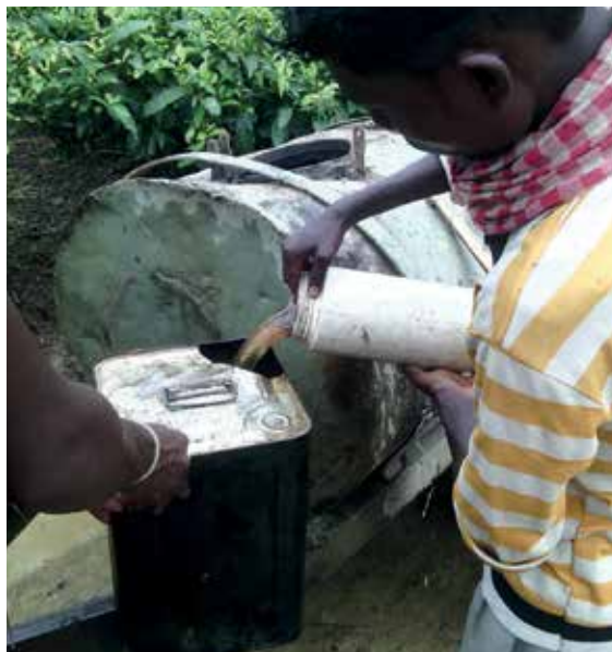
Spraying of pesticides is usually conducted by male workers, mostly youngsters, whose age ranges from 18 to 35 years.

The prenatal and postnatal care as well as access to day-nurseries seemed to be inadequate. While women said that Accredited Social Health Activist workers would come to the labour lines to weigh the children once a month, the women reported that the weight of the babies born amongst the group ranged widely, from 1 kg to 3.8 kg. Women also complained that even though there are around 200 children in the plantation, only those children who can walk are allowed to go to the day-nursery. This results in children that are still being breastfed having to be cared for at home. As a result, many families pay 200 INR every 15 days for a home caretaker. Women complained that conditions are bad and unhygienic