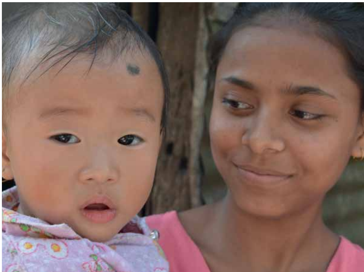
When asked about their wishes for the future, female workers said that they hoped for higher wages so that they could send their children to school.

Workers further complained that the Assam Chah Mazdoor Sangha (ACMS) union does not help the workers. Furthermore, a worker who had recently retired and used to be affiliated with ACMS mentioned that whenever issues are brought to the attention of the management by ACMS, the company always bemoans that the tea industry is a “losing” business. Another worker said that the ACMS union representatives had told the workers that they had