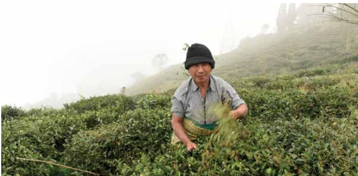
Although the PLA does not differentiate between the benefits that different types of workers are supposed to receive, those who are employed as casual workers reported not being able to access health and welfare provisions of the PLA.

The right to social security guarantees a minimum essential level of benefits to all individuals and families that enables them to acquire at the minimum, essential health care, basic shelter and housing, water and sanitation, food stuffs, and the most basic forms of education. In spite of poverty and appalling living conditions, access to social security has been denied to tea workers and their families by the state governments of Assam and West Bengal—both due to the non-implementation of the PLA and to the fact that tea plantation workers are not legally entitled to benefits under many of the schemes available to other marginalized groups in India—in clear violation of India's social security obligations under international and national law.