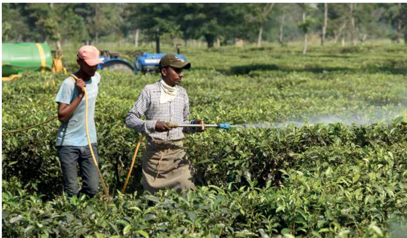
According to the workers interviewed, they are not trained on the use of personal protective equipment.

Often PPE is not provided by the management to the workers engaged in pesticide application. Even if PPE is available, it is given to the workers only during inspections. In most cases, only gloves and shoes of poor quality (and not gear masks) are available. Furthermore, whatever PPE is available is not personally assigned nor numbered, so workers do not maintain the equipment properly and they use the equipment interchangeably, causing a risk of infection or contagious diseases. Very often, the PPE is damaged after being barely used. The management does not replace the damaged PPE, and when workers ask for replacements, management responds that financial burdens prohibit the provision. It is reported that during inspections the management plays a trick on the inspectors: a certain number of workers, with