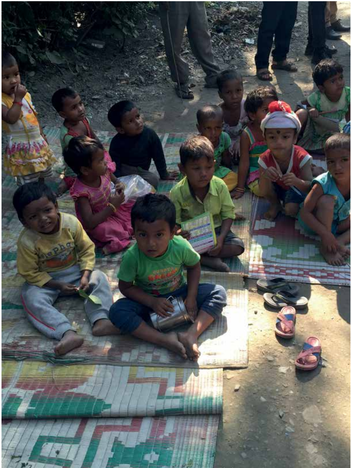
"ICDS Center" in Chamurchi. It is situated on a road with vehicular and pedestrian traffic.