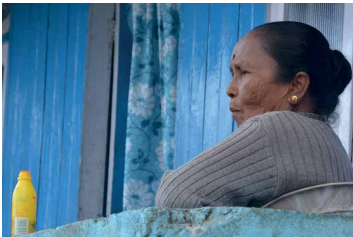
Workers reported that the management does not attend to their demands.

Workers also consistently complained about inaccuracies in reporting the amount of weighed tea leaves. It was reported that there are some staff or 'babus' who are usually responsible for reading the weight off the scale and sometimes they deduct 10 to 12 kg from the real amount. It was reported that a deduction of about 10 kg per worker when weighing leaves is common, as these 10 kg go to workers who are absent and who have a special arrangement with the babus to share the wages that are taken from the workers who did work that day. Workers said that they want to find a way to stop the cheating during the weighing of the leaves, so they themselves often try to see the amount weighed; however, managers do not allow this examination, they themselves being the only ones allowed to read the scale. Workers also mentioned that they have repeatedly brought up the issue of the deductions that happen during the